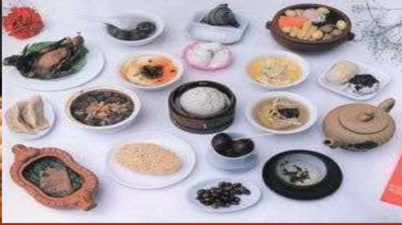
2. Eight Unique of Qinhuai