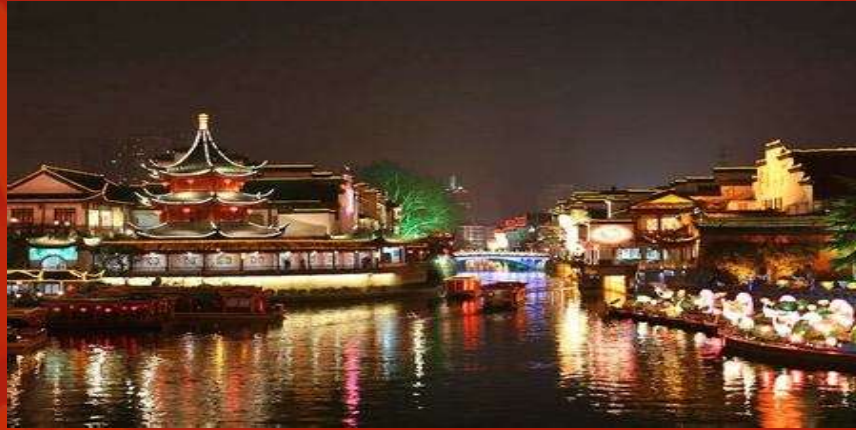
1. Qinhuai River AAAAA Scenic Area