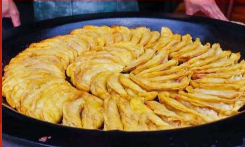
4. Pan-fried Beef Dumplings