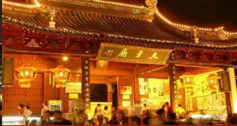
2. Confucius Temple A.D.1034