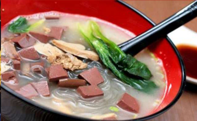
5. Duck Blood Soup