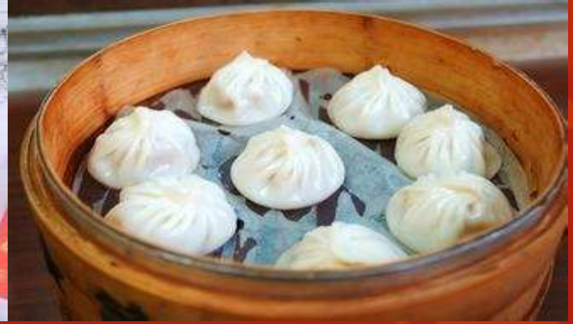
3. Soup Dumpling