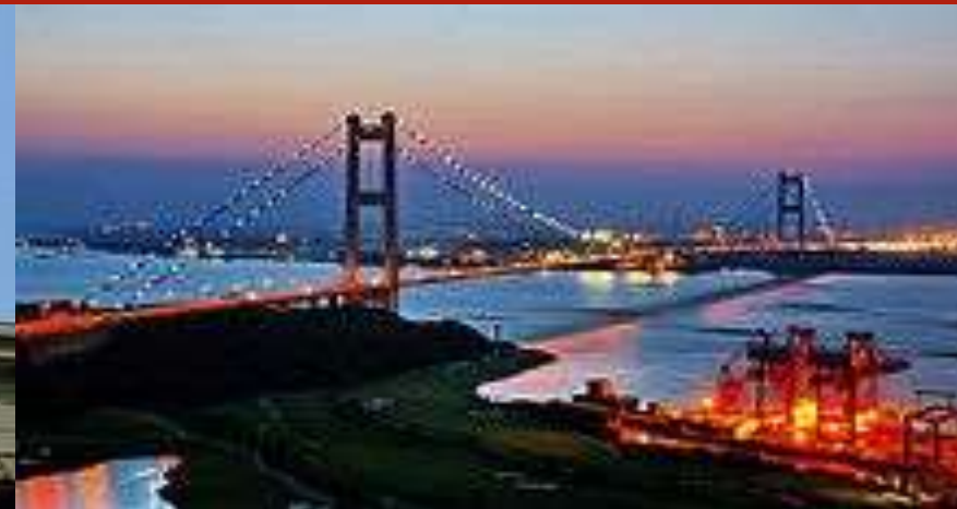
5. Yangtze River Bridge