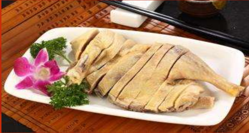
1. Nanjing Salted Duck